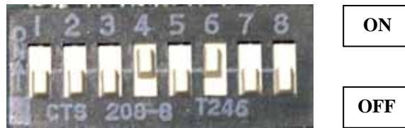
Figure 3. Dipswitch shown set for 500 mA and 12 VDC.