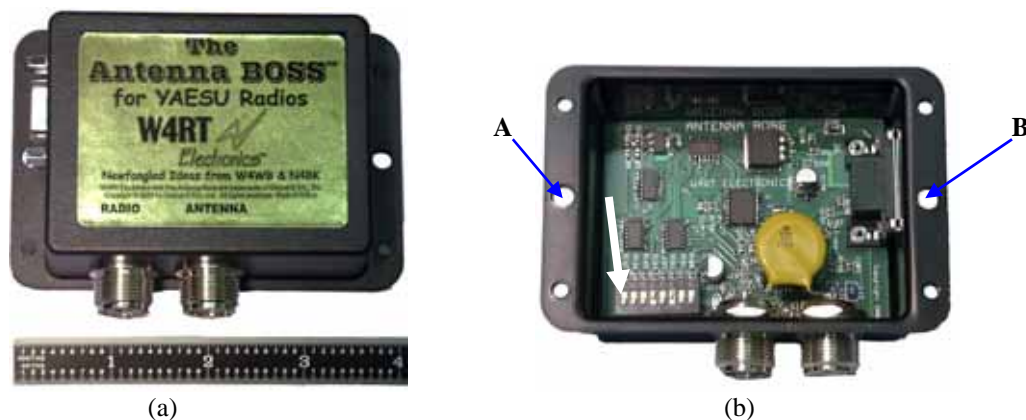
Figure 1. The Antenna BOSS, (a) external view; (b) internal view.

That's all there is to it. When you want to tune your radio, press the radio's TUNE button, and your radio and The Antenna BOSS take control of the adjustment of your motorized antenna. The radio will behave in the same manner as if it were connected to an ATAS antenna; however, remember that the lowest band that Yaesu allows "ATAS operation" on is 40 meters. The Antenna BOSS also provides a manual means for you to operate on 60, 80 and 160 m. If the run current of your antenna exceeds about 800 mA, you should contact your antenna provider and inquire about a motor upgrade.